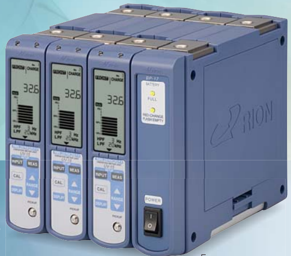
Configuration example showing three UV-15 units with BP-17

Provides connectivity for piezoelectric accelerometers, accelerometers with integrated preamplifier, and TEDS compliant accelerometers.